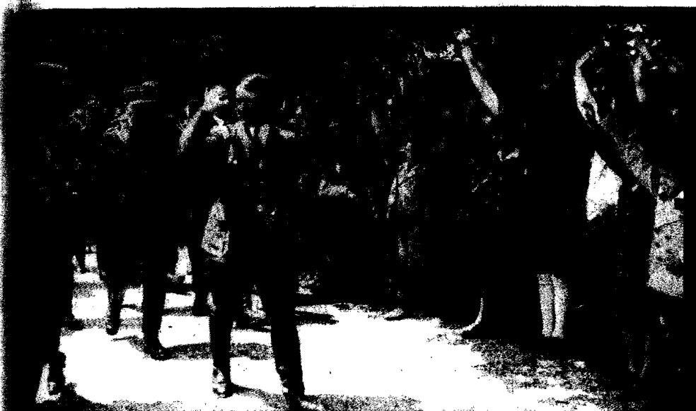
1933 GERMANY: The world regarded Hitler as a joke until the Depression tilted German voters toward the Nazis. In March 1933 he seized power as dictator.

of ti- ter es- ng gy in ng rd he th ick Air to ias via ors ge: in rd.